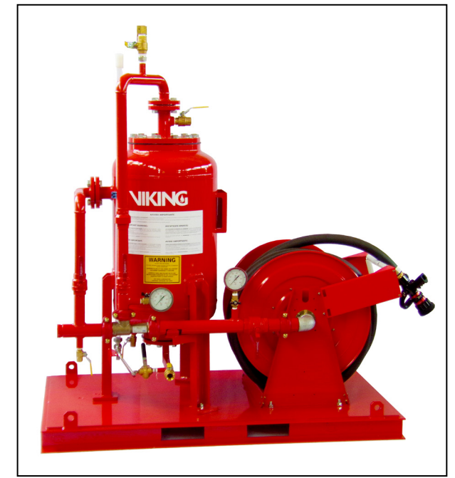
Photographs are for illustration purposes only. Refer to drawings for actual design details.

NOTE: Other international approval certificates may be available upon request.